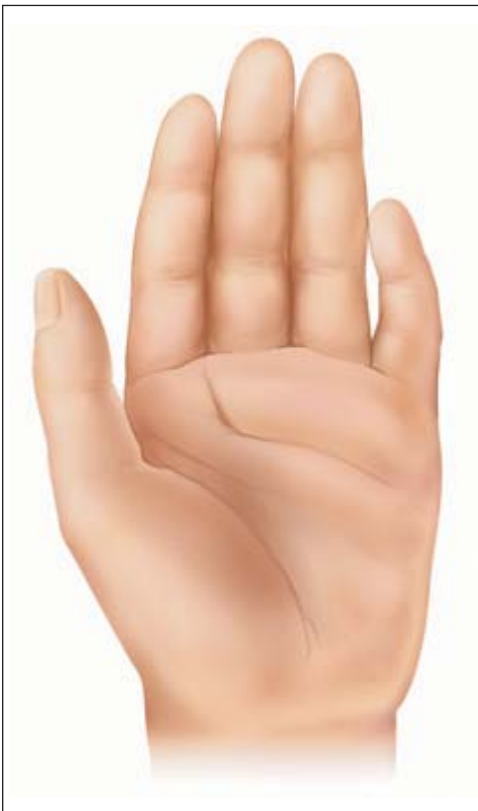
Figure 5. Characteristic features of a hand of a child with fetal alcohol spectrum disorders. Note the curved fifth finger (clinodactyly) and the upper palmar crease that widens and ends between the second and third fingers (“hockey stick” crease).

5), hirsutism, and cardiac defects. Prenatal or postnatal growth retardation typically results in a height or weight below the 10th percentile for age and race. Microcephaly is common, as are structural brain anomalies. CNS impairment may not be apparent in newborns. Cognitive deficits and behavioral anomalies such as attention-deficit/hyperactivity disorder typically become more apparent in school-aged children with FASD and usually persist into adolescence and adulthood, whereas facial findings among the subset with FAS may become less characteristic.