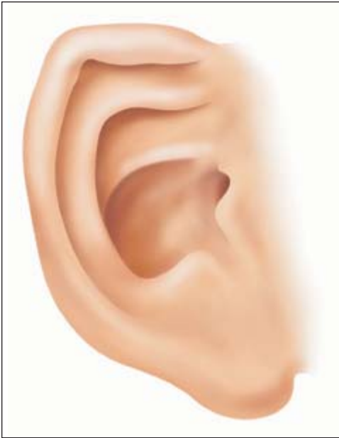
Figure 4. Characteristic features of an ear of a child with fetal alcohol spectrum disorders. Note the underdeveloped upper part of the ear parallel to the ear crease below (“railroad track” appearance).