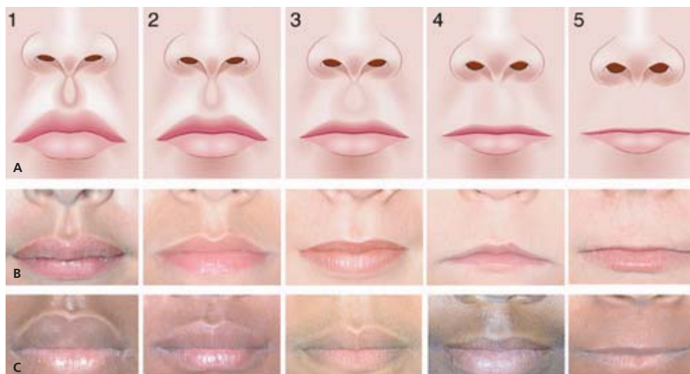
Figure 3. Lip-Philtrum Guide. (A) The smoothness of the philtrum and the thinness of the upper lip are assessed individually on a scale of 1 to 5 (1 = unaffected, 5 = most severe). The patient must have a relaxed facial expression, because a smile can alter lip thinness and philtrum smoothness. Scores of 4 and 5, in addition to short palpebral fissures, correspond to fetal alcohol syndrome. (B) Guide for white patients. (C) Guide for black patients.